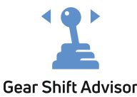
Gear Shift Advisor