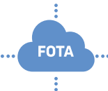
Firmware Over The Air